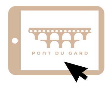
Tourism professionals, enjoy BtoB, with a personalised account.